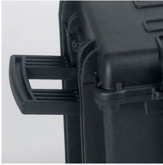
TWO MAN LIFT SIDE HANDLES