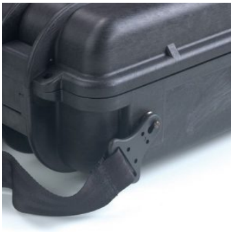
OPTIONAL SHOULDER STRAP (universal) (art. SHOULDERKIT.U)