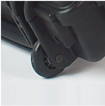
WHEELS WITH BEARINGS